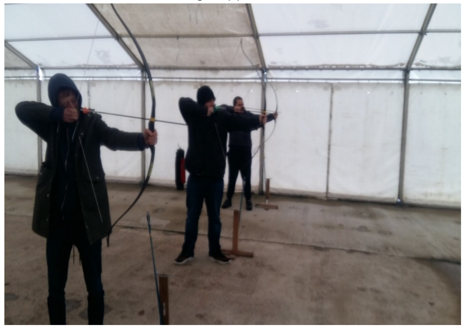
Local residents trying their hand at archery