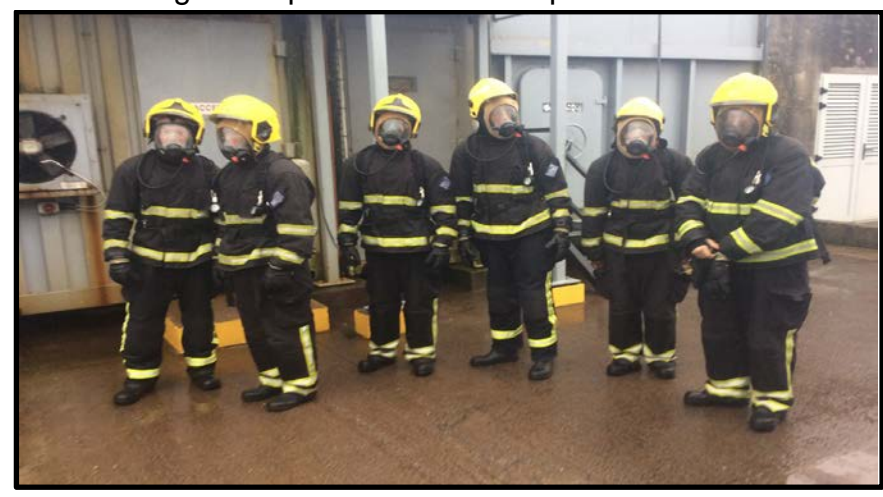
Oceans students, including 2 from Lurgan, in the 'Firefighting' class