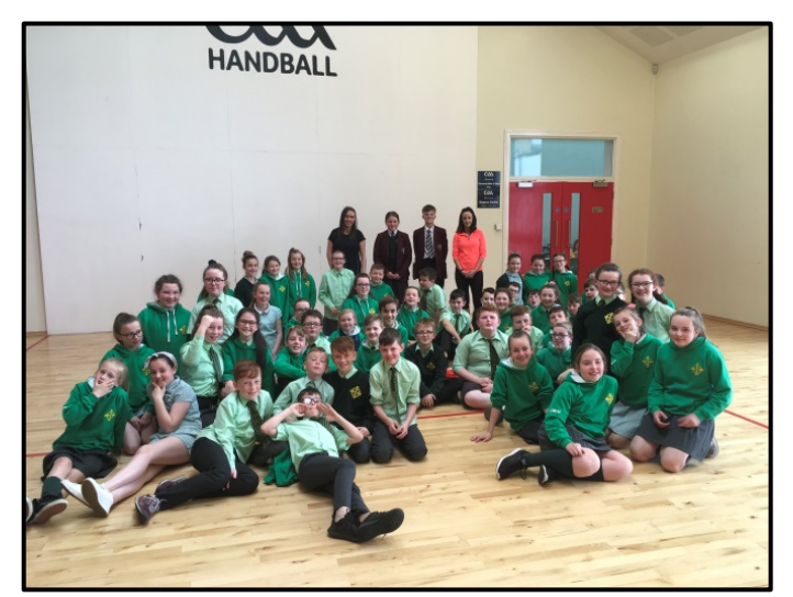
Tannaghmore Primary School