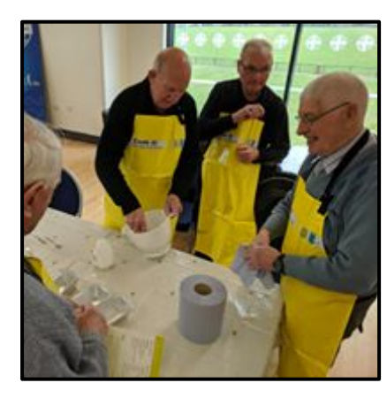
COOK IT – getting the men involved