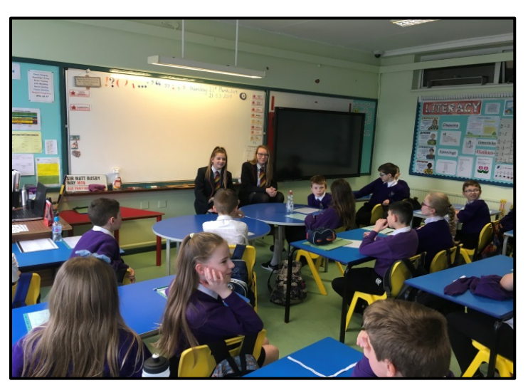
Carrick Primary School