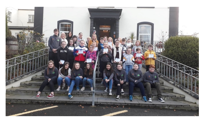
Youth Forum Conference