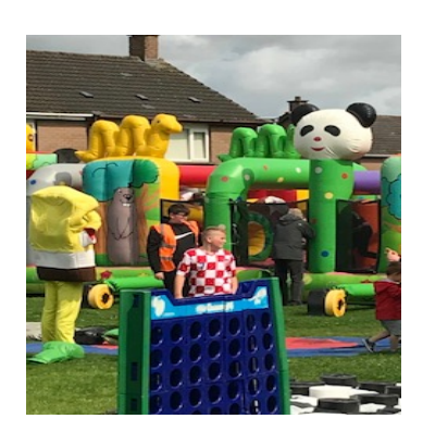
The Glens Festival

Funding received from the CLEAR programme provided a range of additional provision such as craft classes, armchair exercises, drama, outdoor activities for young people, Cook It classes for young and older people and a drug and alcohol awareness session for all ages.