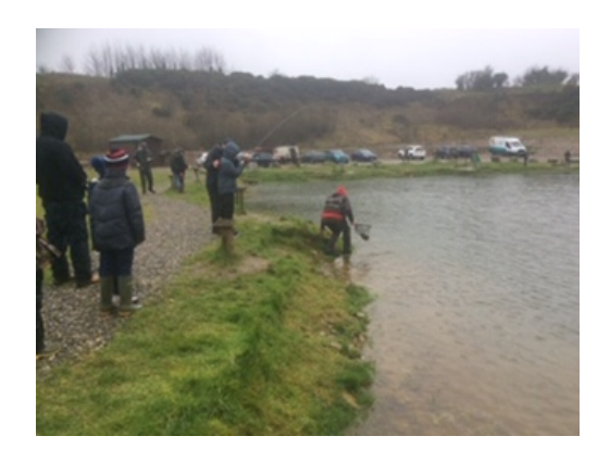
The Glens Fishing Club

The Glens Community Association also delivered classes and activities such as sewing/knitting classes, a fly tying/fishing programme, volunteer team-building, activities for physical and mental health, Summer Diversionary activities such as a Community Festival, (attended by over 350 people from the Glens and neighbouring estates), children's Christmas party and Christmas dinner for 30 elderly people. These programmes encouraged all ages to come into the community house and see what has been on offer.