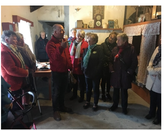
Older People's Outings