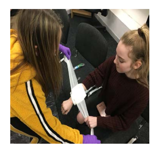
First Aid with Coastal Core