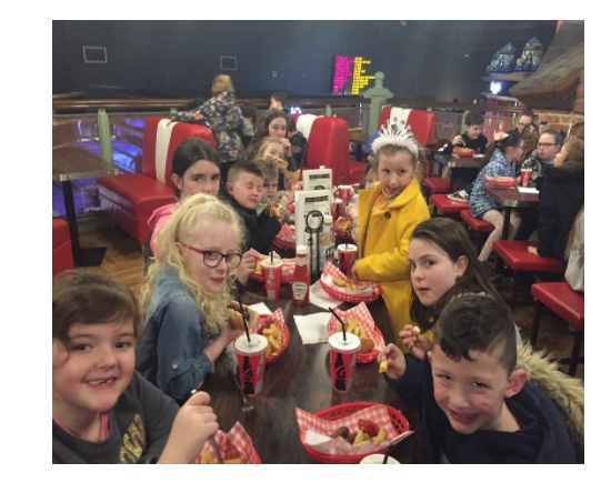
Confidence Building at Roe Valley Arts and Cultural Centre