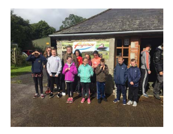
FoyleHov Social Outing

The children engaged and embraced this new element of learning exceptionally well. They showed an increase in confidence and self-esteem over the duration of the project and friendships became stronger. The children expressed a real sense of enjoyment through characterisation and play. The young people then showcased their event in the Roe Valley Arts and Cultural Centre, Limavady.