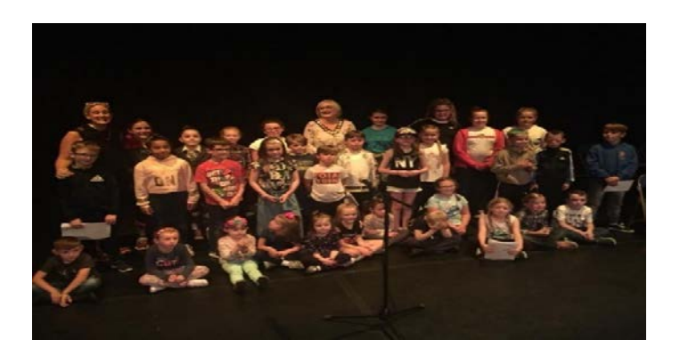
The Drive Choir at the Arts & Cultural Centre

The Drive Choir - In addition to the fun element for young people, singing is also known to reduce stress, improve posture and keep young people mentally alert. Community music programmes work well with young people who prefer a low-key music experience. Feedback from parents/carers indicated that singing increased self confidence in their young people. The young people also performed for their families and friends at the Roe Valley Arts and Cultural Centre.