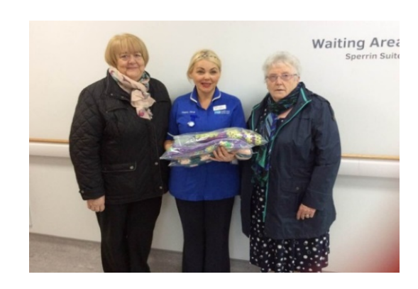
Hats, cardigans and jumpers for Malawi