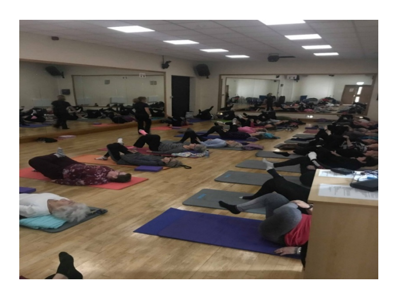
Ladies Positive Lifestyle Classes

Healthy Families - Included programmes for the NR communities which were well supported throughout the year. 'Healthy Families' was delivered via LCDI, and incorporated cookery, Grow your Own and games. Families participated in making meals in the LCDI kitchen, growing herbs and vegetables and using these in their cookery. The children involved helped and took part in play outdoors and in Kids Ahoy. 'Family games and cookery' ran in the summer months when children were off school and families enjoyed participating in a variety of activities such as Zumba, circuits, quick cricket, and disability ball games as well as a range of healthy eating with meals supplied by the parents and involving The Glens & Bovally Community Associations.