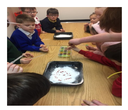
Health & Hygiene

The Environmental Programme worked to strengthen family and community bonds, promote civic pride and develop a better understanding of nature and local wildlife. Young people, volunteers and family members learned about germinating seeds and how to use tools and prepare the ground. By planting hanging baskets, litter picks and creating sensory fairy gardens for each of the centres, this programme encouraged a sense of pride within the local communities and improved relations.