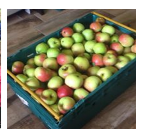
Community Garden Workers and Produce