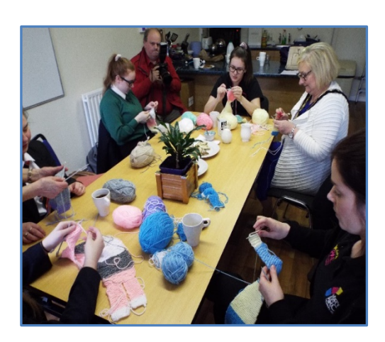
Dry Arch Halloween Event