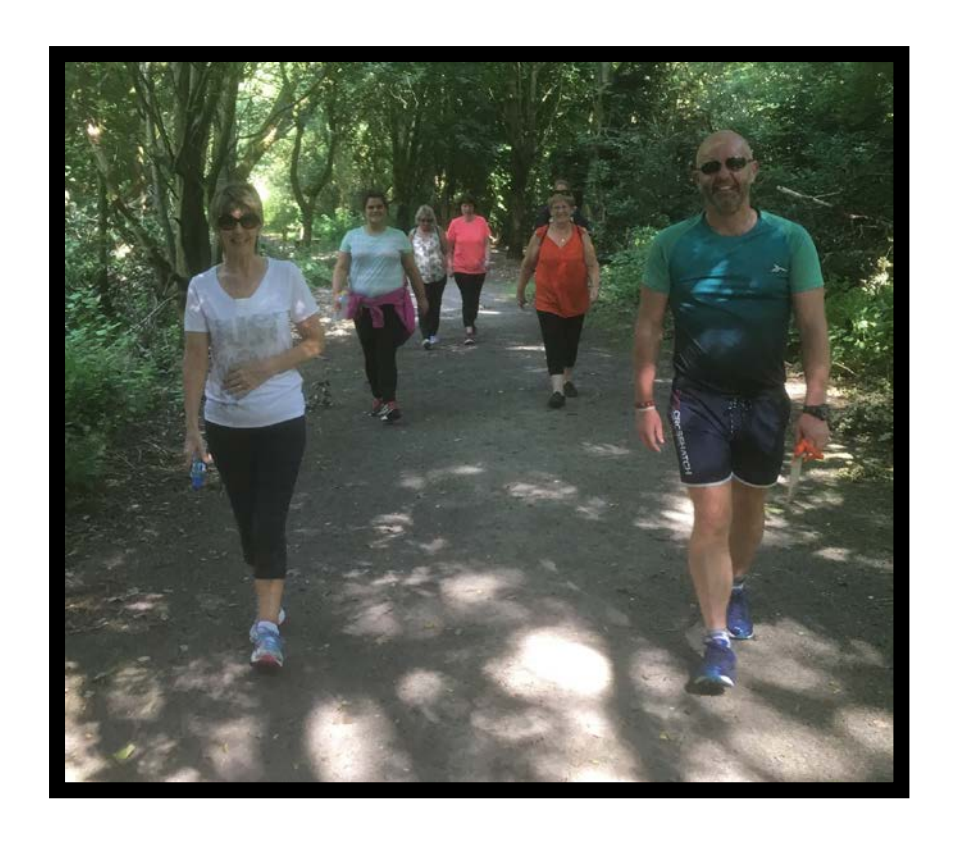
Some of the participants in the hill-walking programme