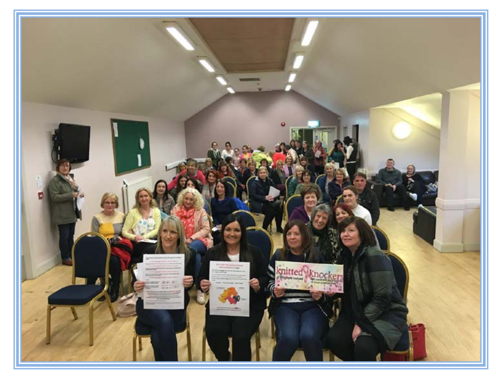
Local people attending a Breast Cancer Awareness event at the West Armagh Consortium