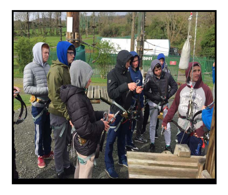
Young people taking part in the Positive Futures programme run by the SPRING Trust